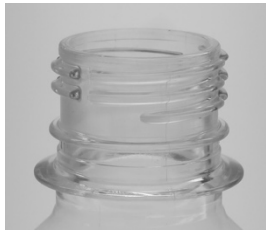
Cap ring removed

How do I recognize the bottle standards?