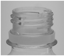
Cap ring present